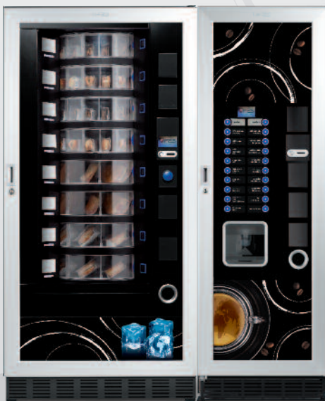
Easy 6000 GCD + Winning GCD