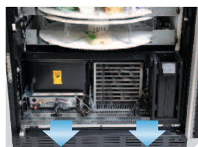
Compact cooling unit easily extractable