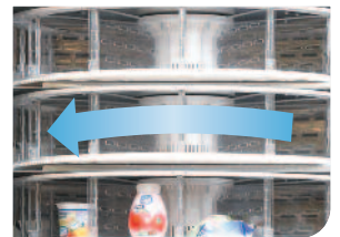
Automatic opening and closing delivery doors