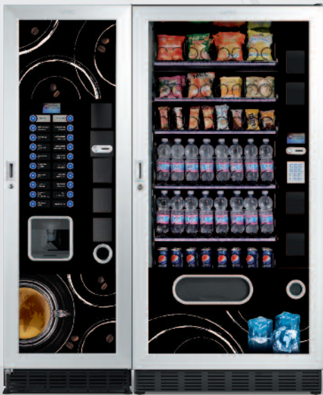
Winning GCD + Faster GCD 900